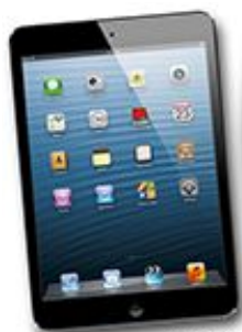
32gb iPad Mini

Each year during the AADA convention, the Foundation for Dental Health Education (FDHE) conducts a raffle to raise funds for the grants it awards. Be sure to purchase your raffle tickets from a designated Foundation volunteer and be present during the President's Reception for your chance to take home an iPad Mini! Raffle tickets are 5 for $20.00, 20 for $50.00 or 60 for $100.00 and can be purchased in advance by contacting Trish at AADA@AllianceADA.org .