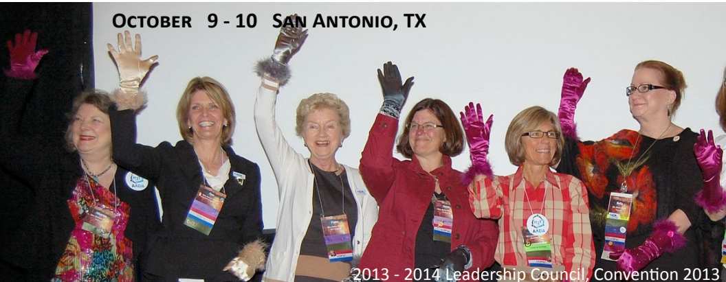
2013 - 2014 Leadership Council, Convention 2013