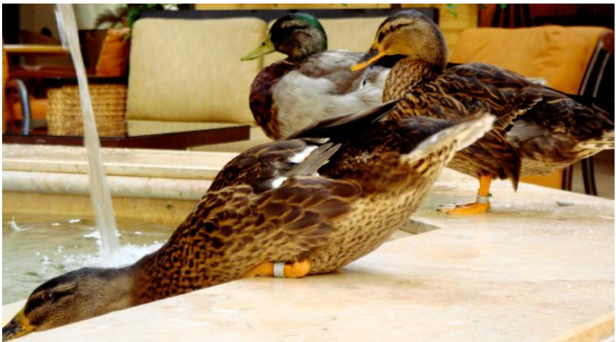
Peabody Hotel Ducks

Alliance of the American Dental Association: The support community for it's members and the ADA